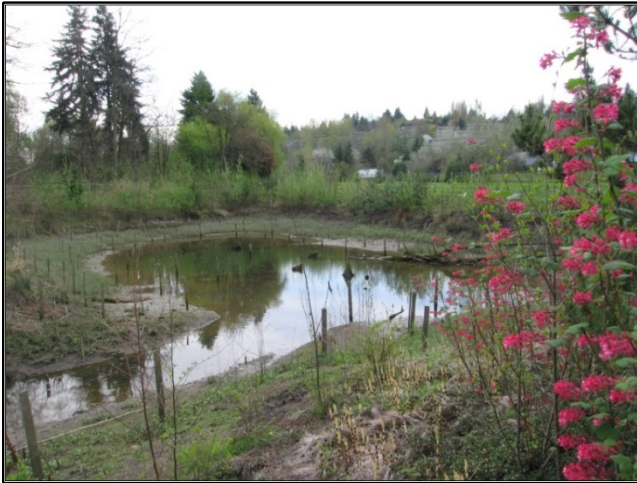
Herring's House, a restoration project built in 2001 at River Mile 1 on the Duwamish